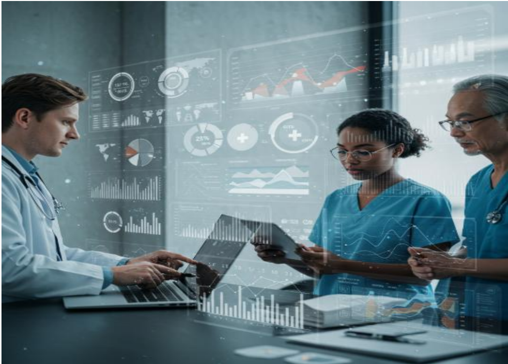
Fig 3.1: Data-Driven Healthcare

strict, internationally established criteria of empirical evidence, is severely limited. Subsequently, it is emphasized that for the most part, the publicly available databases are devoid of the medically meaningful (and expected) detailed topography-based descriptions, such as the relative contributions of fibroadipose tissue within the bulk mass of the breast and the amount of muscle fiber within the corporeal mass.