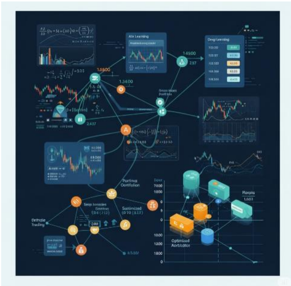
Fig 10.1: Algorithmic Trading and Portfolio Optimization

The research and academic effort has focused on the predictability of financial market excess returns, which had been the research goal of early signal generation studies. AI is directly relevant to these problems, as it is now possible to train AI systems to solve the temporal or spatiotemporal problems posed by these studies directly, simply and effectively. Unlike traditional time series methods, AI systems do not require market data stationarity or normalization, nor do they rely heavily on feature engineering to convert market data into particular domains or components (Rajan, 2025; Santos & Xu, 2025).