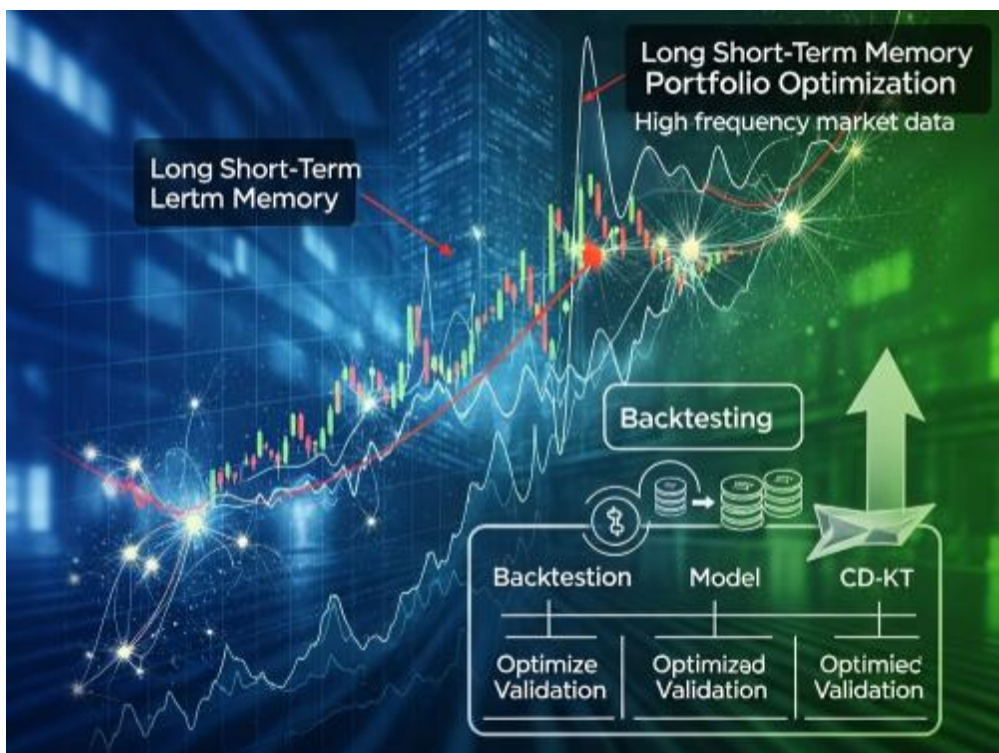
Fig 10.2: Deep Learning Techniques of Algorithmic Trading

improving speed and accuracy, sometimes even by an order of magnitude. Also deserves mention the growing availability of high-performance computational facilities, including GPUs and TPUs, increase in the availability of large datasets, and the emergence of powerful visualized deep learning software frameworks, thus helping practitioners focus more on approaches than implementation. In brief, deep learning enables better performance on varied AI tasks, improving on traditional ML methods and becoming the foundation of increased AI automation. It is believed by some that deep learning may even render ML unnecessary for many applications. Traditional ML techniques and deep learning methods are thus not necessarily seen as mutually exclusive; rather, deep learning acts as a scalable and state-of-the-art approach to both specific and general tasks in many AI applications. The innovation is thus by making hard problems easier again. With the rapidly evolving financial technology ecosystem, deep learning techniques have emerged as an important new class of algorithms in financial applications. The appropriate use of deep learning methods requires careful consideration of the massive amount of financial data, its structure, representation, the tasks in question, theoretical understanding, and domain knowledge, in tandem with building on the success of traditional approaches. Indeed, traditional techniques and deep learning methods are again synergistic.