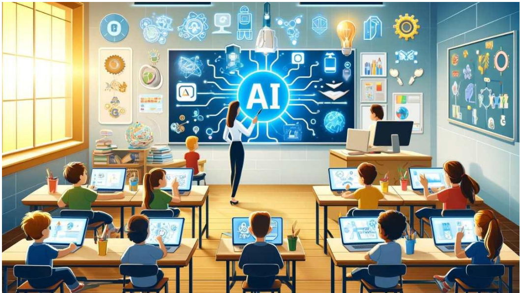
Fig.3.2. AI use in the assessment process in the classroom