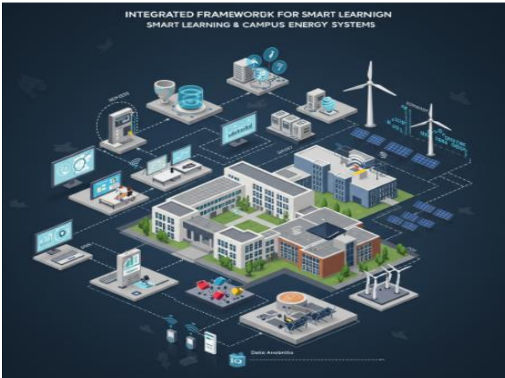
Fig 4 . 1 : Integrated Framework for Smart Learning & Campus Energy Systems

We start this document with a short overview of what we understand as learning platforms and energy management systems, what type of functionality they provide, and what kind of features they could provide if more advanced integration between IT systems were to take place. We also provide a brief review of related work in the field of Smart Learning Environments. The second section outlines the energy management problem with a focus on University Campuses. We describe the Campus Aggregate Model, and how it allows building the energy management problem as a market problem, how specific campus management constraints are addressed, and then summarises the policy changes supporting the new high-accuracy campus model. The proposed platform development framework and reference architecture, which aims to support both short term and longer term integration of Open Source Learning Platforms and Campus Energy Management Systems is described in Section 3.