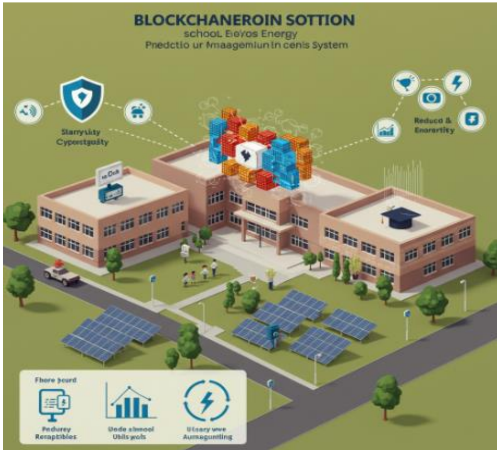
Fig 4 . 3 : Blockchain in School Energy Systems: Cybersecurity & Cost Benefits

coordinate tasks across vast sets of entities. Numerous features can be enhanced, a significant one for consideration being smart contracts, which enable a summary set of rules to be defined that allow entities operating at a distance from each other to execute a contract without the need for the client to rely on centralized entities. These fall into several categories and offer varying levels of added security to the IT infrastructure and the underlying distributed energy system.