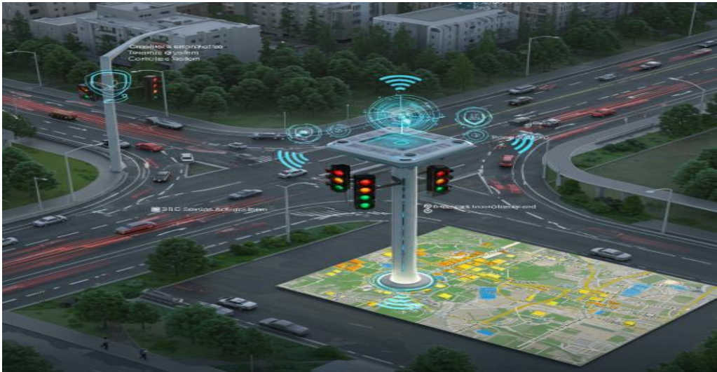
Fig 6 . 2 : Self-Adaptive Traffic Signal Control System Based on Future Traffic Environment

Self-optimizing routing architectures are intelligent, adaptive systems, whose behavior under worst-case assumptions can be evaluated by first considering the idealized case introduced in the rest of the text. In the ideal special case at hand, the demand at each entrance arrives at a unique exit, and to move forward it must first cross an internal intersection. The presented traffic light schedule exactly realizes the following function: at any combination of moments where the demand arrives at a new intersection, or anticipation remains from the last arrival, determine the optimal sequence of the next pair(s) of green lights for that particular entrance. Any adaptive system consists of two components: a black box (the actual adaptive system) and a white box, which is capable of determining the input-output relation of the black box or may, additionally, act as a model for it. In our case, the black box is an intelligent, adaptive traffic management system, and the white box is a set of AI modules capable of predicting its behavior, input-output relationships, and of course enforcing it to yield desired outputs.