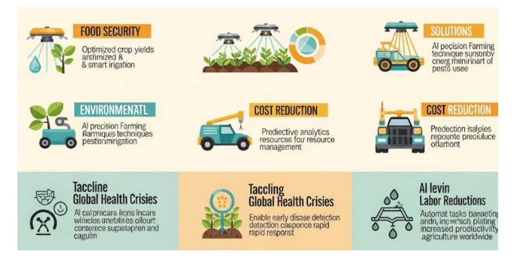
Fig 10.3: AI Revolutionizing Agriculture

their own agricultural digital transformations to achieve similar successful results. As the global agriculture landscape continues its transition into incorporating advanced technologies to support agricultural operations, we believe that an increased allocation of investment capital towards AI innovation in the agricultural space will aid in this transition, and the case studies included will ideally serve as an initial resource into this practice. Further, as the case study contents in this body of work merely detail a highlevel overview of each respective project, we would also encourage collaboration among similar stakeholders involved in these innovative projects who may be willing to share details for the sake of collectively moving the industry and its challenges forward.